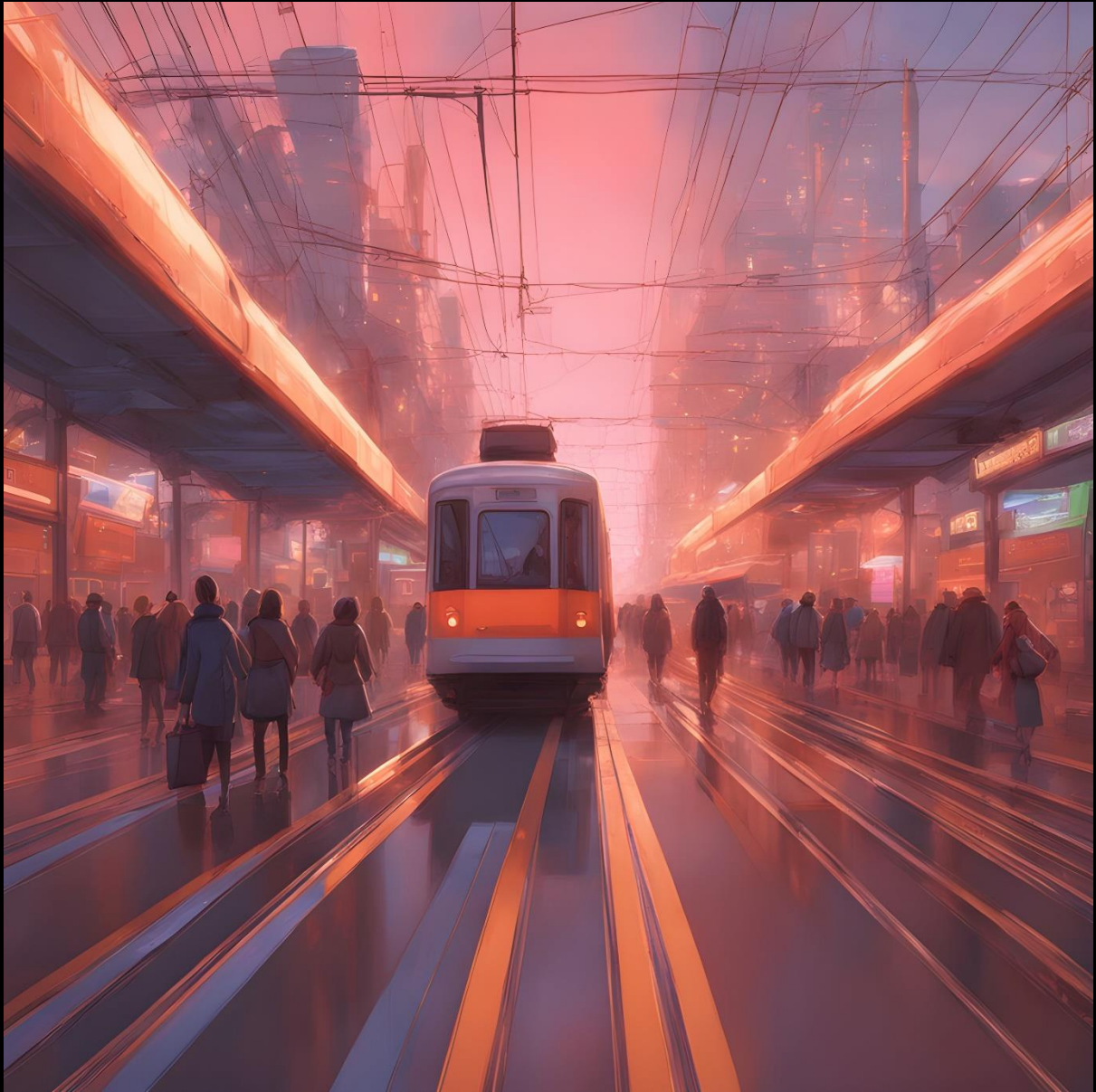
Trolley Interference Thought Experiment