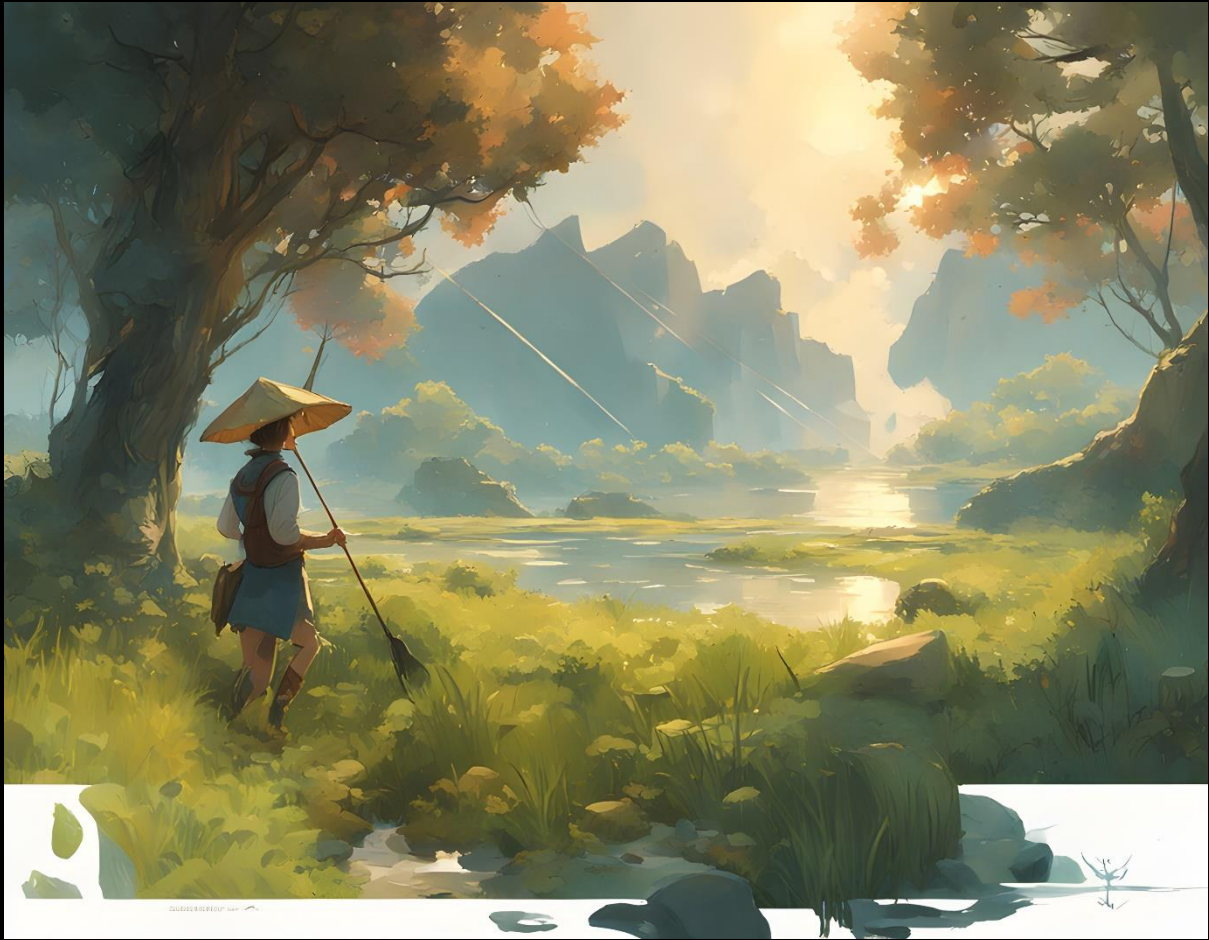
φ This one farmer does not betray she also star angler.