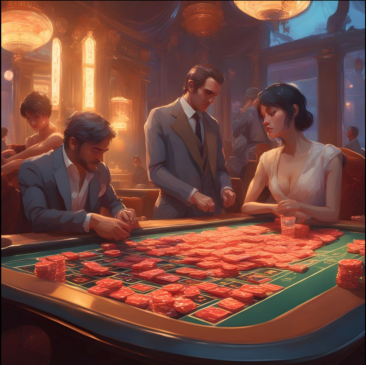
Gambling before first experiment night before big fight three divorce.